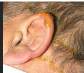
O2 Saturation Probe