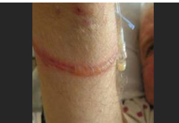
Arterial Line Tubing